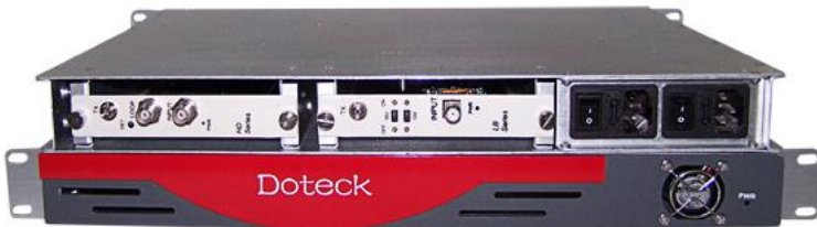
2-slot, 19-inch, dual power supply