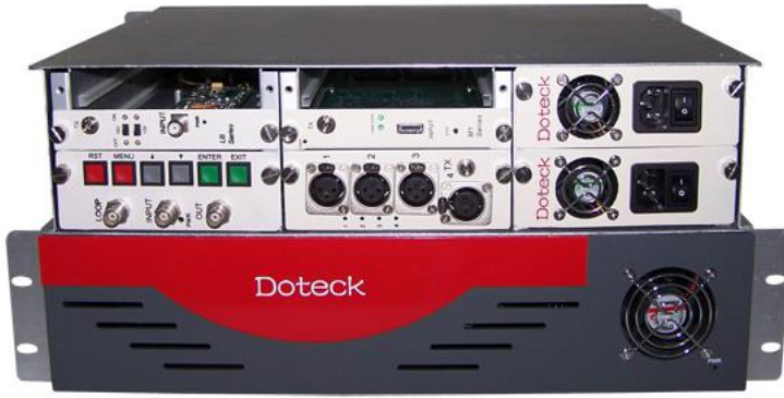
8-slot, 19-inch, dual power supply