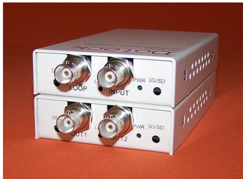
Mini Box, external power supply