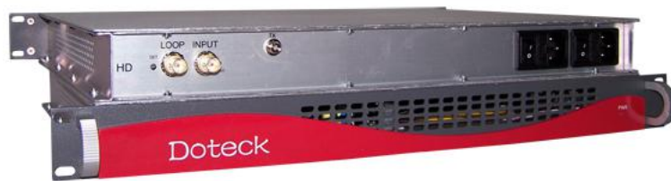
Fixed 19-inch 1RU standard cabinet with dual power supply