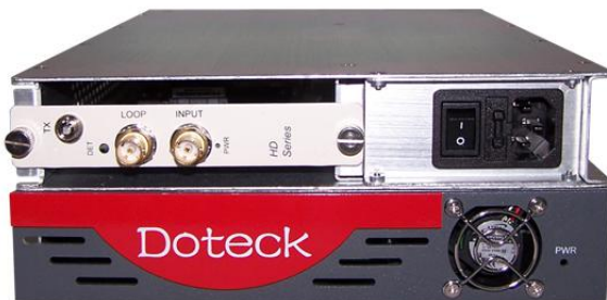
One slot, built-in power supply